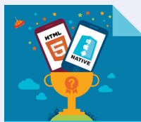
The HTML5 vs. Native Debate is Over and the Winner is...