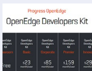
OpenEdge Developers Kit