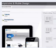
Sitefinity at a Glance