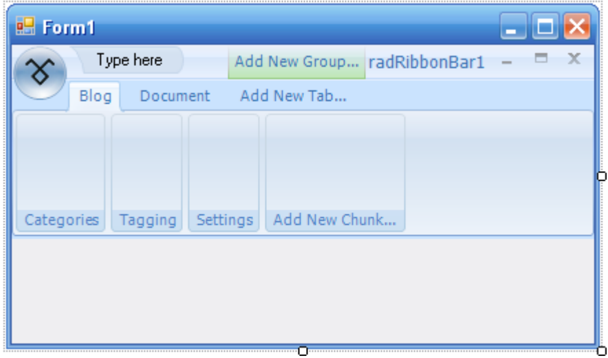
Figure 1: Sample App UI Design in Visual Studio 2005 after step 7