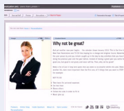
Sitefinity CMS: Website Personalization