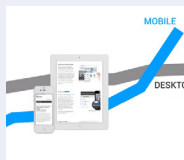
A CMS Solution for Any Mobile Strategy