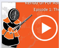
The Basics of UI for ASP.NET MVC