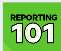
Reporting 101 Whitepaper